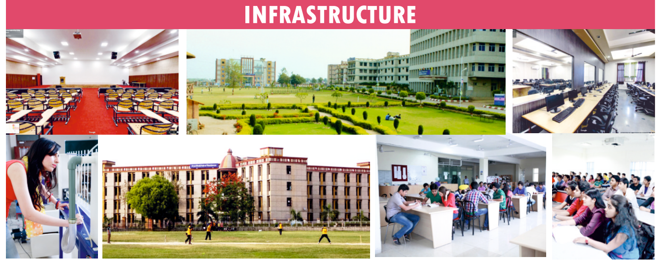
• College campus • Numerous Boys & Girls Hostel • Hosteller's Mess • Faculty Supervision • Wide array of Cafeteria choices • Jogger's Park • Basketball, Volleyball and Badminton court • Recreation Rooms for indoor sports • Cricket Stadium • Two Auditoriums • Seven Libraries with over 70,000 books • Two Banks • Campus Hospital • Transport Facility Available • Diligent Security Team always on the standby • WiFi facility • Centralised RO water facility • 24/7 CCTV coverage of the Campus